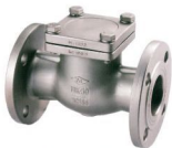
DIN PN 10/16