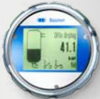
Green = ok

Why waste more than a second determining whether you need to take action?