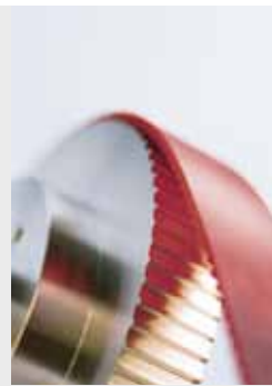
APSOdrive® Drive Technology