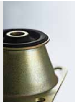
APSOvib® Antivibration Technology