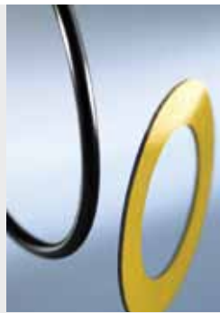
APSOseal® Sealing Technology