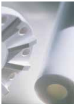
APSOplast® Engineering Plastics Technology