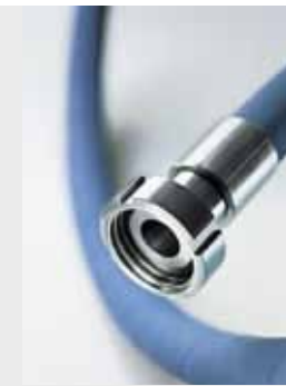
APSOfluid® Fluid Handling Technology